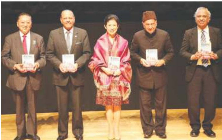
Japanese edition released by H.I.H Princess Takamodo at Tokyo on April 8

The highlights of SIT's board spectrum activities during this period were the releases of four more foreign language editions of its widely acclaimed 'Gandhi's Outstanding Leadership' publication. These were the Japanese, Czech, Farsi and Greek editions. Photos and details there of are printed hereunder.