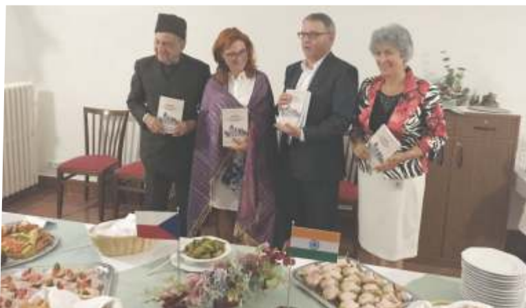
Czech edition released at Prague on September 14 by Hon'ble Mr. Lubomir Zaoralek, former Foreign Minister & Chairman of Czech Parliament's Foreign Relations